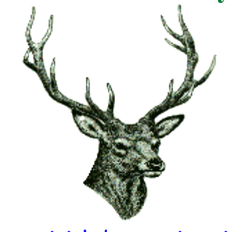
Irish Deer Society